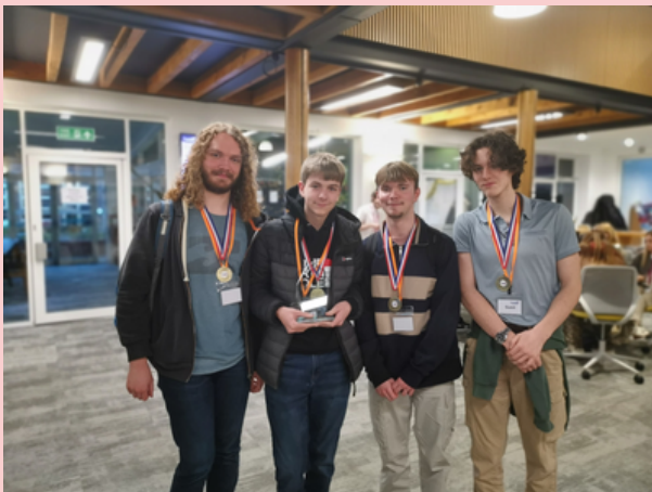
Sixth Form Maths Challenge Winners More on Sixth Form Successes Page