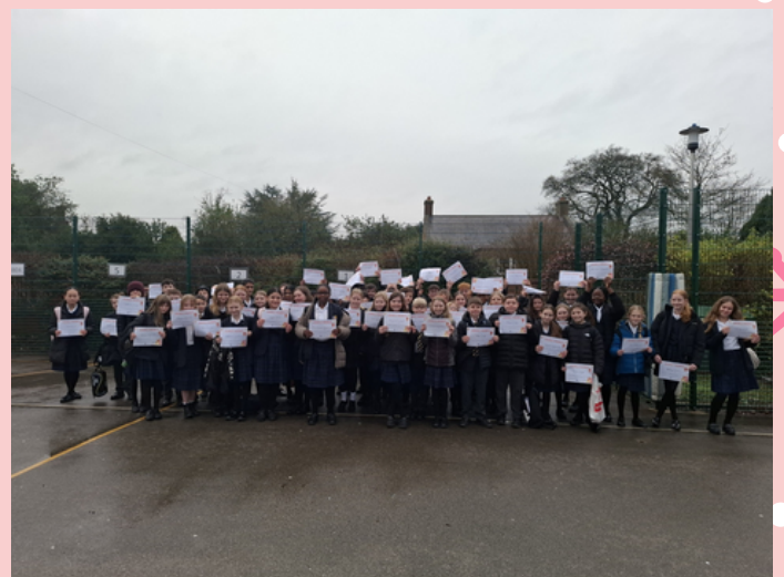
Year 7 Celebration Assembly

I am delighted to report that Year 10 students have made a very positive start to their GCSE subjects. They have approached this new stage of their learning with enthusiasm and commitment, and we look forward to supporting them on what we hope will be a successful and rewarding journey throughout Year 10.