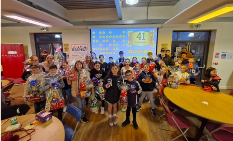
Easter Bingo Success